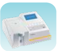
Semi Auto Bio Chemistry Analyzer